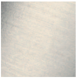
platinum matt 29 140 660-06