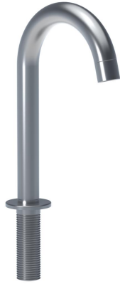
090B Swivel spout. Hole cut out size: 22 mm.