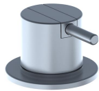
500 One-handle table-mounted mixer.